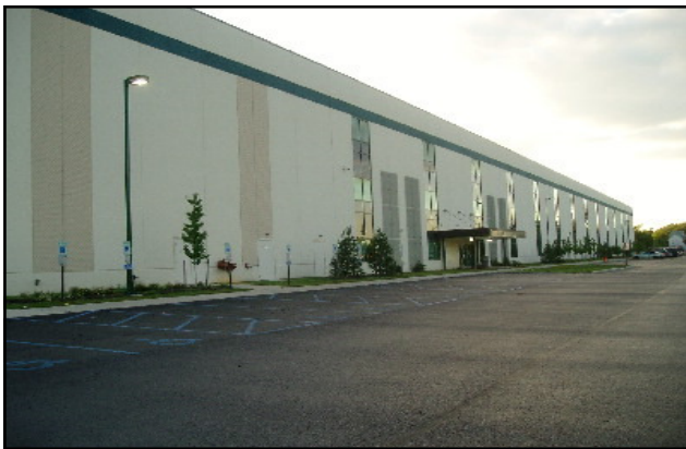
Burlington Coat Factory Distribution Center at 4287 US Route 130 South, in Edgewater Park, NJ